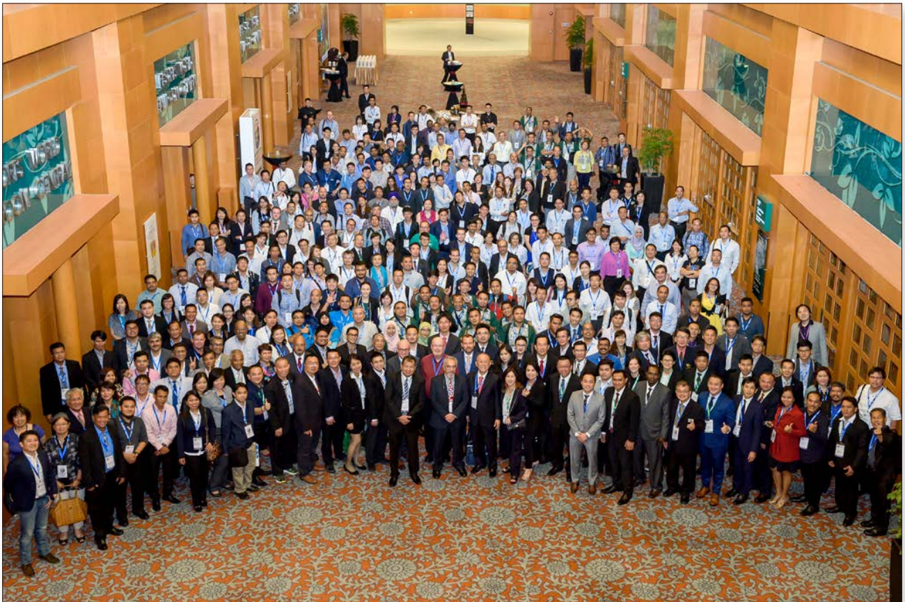
The merging of FAOPMA with Pest Summit at Singapore in 2016 created a stronger voice for the pest management industry throughout the Asia-Pacific Region.

demonstrate to their shareholders that the company can also grow organically. This leads to the need for more sales, but if investment in training personnel and personnel numbers are compromised, the quality of the service will drop.